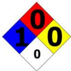
NFPA SCALE (0-4)

A trade secret is being claimed for a specific chemical identity and exact percentages. Other Non-GHS Classification: